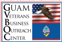
IN PARTNERSHIP WITH THE U.S. SBA & THE UNIVERSITY OF GUAM