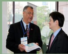
Taiwan SelectUSA EXPO

GEDA lead numerous trade missions in 2012, marketing Guam in Taiwan, Okinawa, Russia, Japan and Hong Kong.