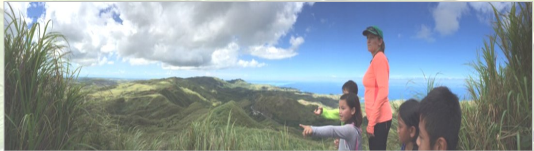
Kika Camp participants point out "badlands" or signs of erosion from the ridge of Humuyong Manglo while learning about impacts on coral reefs from erosion and wildland fires.