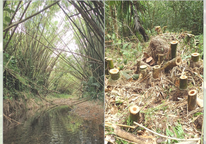
Bamusa vulgaris, an invasive bamboo, is widespread on Guam and out-competes native vegetation. Heavy rains topple bamboo stands which dam up and cause streambank erosion, flooding, and property damage. The before and after removal pilot project at the Geus Watershed with herbicide application. Area will be replanted with native species, restoring forest and preventing sedimentation in the river.