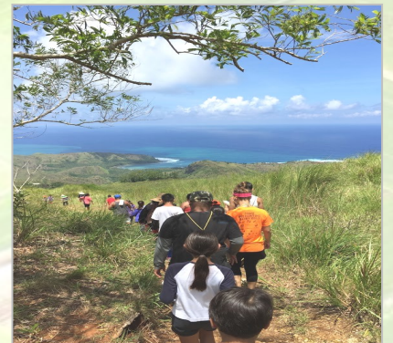
2015 Kika participants hike up Mt. LamLam as part of their ridge-to-reef experience to learn how erosion impacts Guam's precious habitats and marine resources.