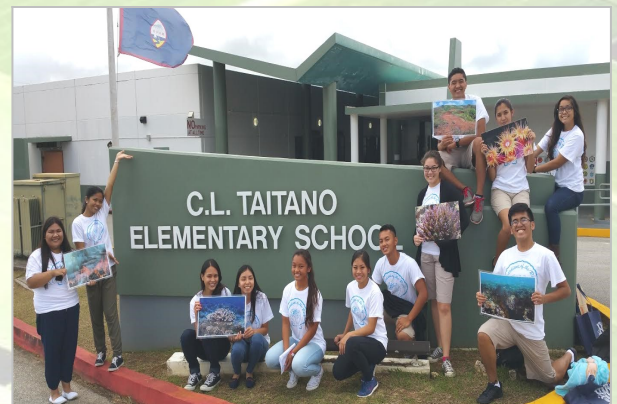
GWHS Guardians of the Reef conduct training with C.L. Taitano Elementary students regarding the importance of protecting Guam's coral reefs and how to prepare visual aids.