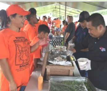
Pork In The Park Cook-off contestants present for tasting their culinary creations using pork from the pig hunting derby.