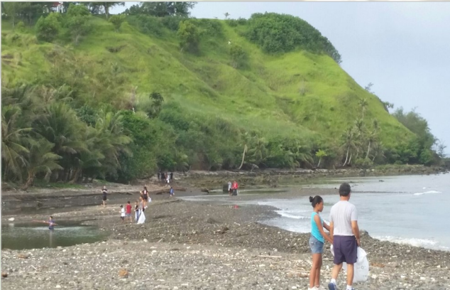
2015 GICC attracted 4,134 volunteers collecting 1,776 trash bags of 21,167 pounds of debris. Site: Umatac Bay