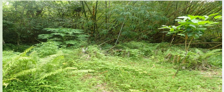
BSP coordinated the pilot project for the removal of invasive bamboo at the Manell-Geus (Merizo) watershed for forest restoration and replanting of native species. One year after the initial cutting, vegetation has proliferated and flourished in the area.