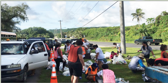
2016 GICC attracted 4,869 volunteers collecting 125,980 trash items weighing a total of 20,038 pounds. Site: Ipan Talofofu