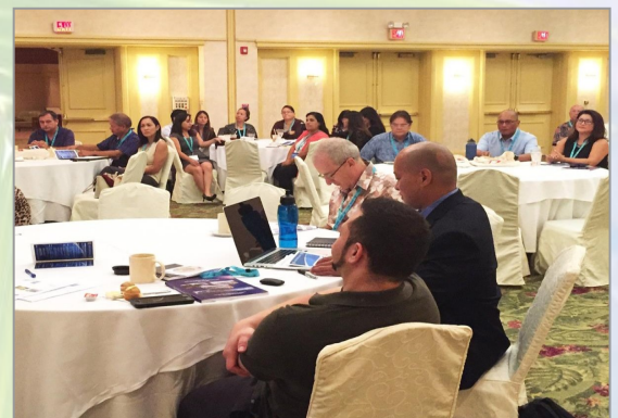
GCMP hosted the first ever Planners Symposium which brought together local, private, military and federal technical experts to discuss policy, best practices and how to effectively address policy changes to ensure protection of the islands natural resources.

BSP's expenditures primarily consisted of salaries and benefits. Operational expenditures from the General Fund included contractual, telephone and supplies, and subsidized rent for the Guam Developmental Disabilities Council (GDCC). Of the 31 employees of the Bureau in FY 2016, 19 were locally funded and 12 were 100 percent federally funded. A total $822,109 in federal funds was used to cover personnel expenses.