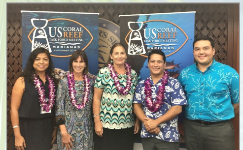
Guam & CNMI co-hosted the 36th U.S. Coral Reef Task Force with member states, local, federal and fisheries and marine stakeholders.