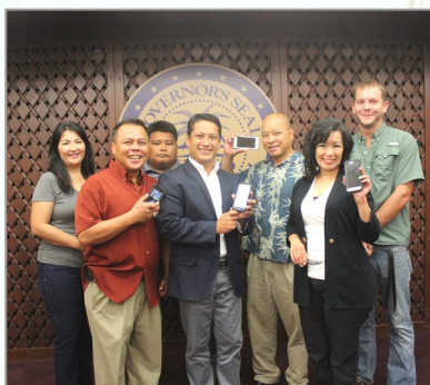
Guam Coastal Management Program, Cost Savings/Innovative Idea of the Year - Guam Mobile Land App

In FY 2016, the Bureau was recognized with the following MagPro Award of Excellence: