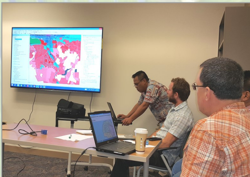
U.S. Census Bureau, Geography Division Staff, meeting with BSP and GIS User Group and other local partners in preparation for 2020 Guam Census.