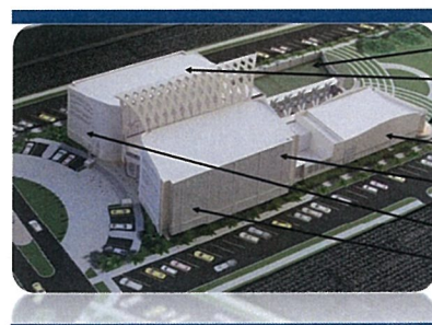
Model of Guam Museum project