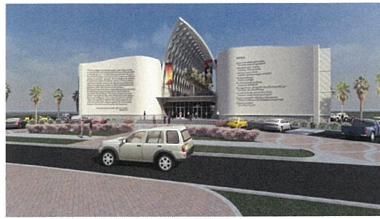
MUSEUM ENTRANCE Guam Museum Ltd. GUAM + CHAMORRO EDUCATIONAL FACILITY Architects: Laporte + Gonzalez

In preparation for the opening of the new Guam Museum, the staff of the Guam Museum worked on various aspects of the project: