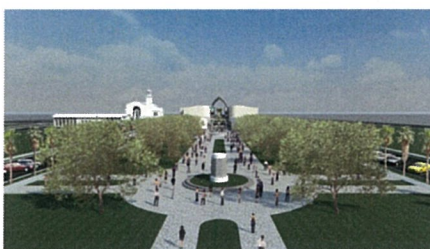
Guam Museum Ltd. GUAM + CHAMORRO EDUCATIONAL FACILITY Architects: Laporte + Gonzalez