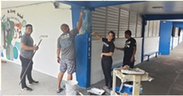
From 2010-2018, DMA adopted and helped prepare Merizo Elementary School for the start of the school year. Employees of DMA and Guam National Guard assisted in painting, water blasting, pruning of plants and trees, fixing electrical and plumbing at no cost to the school.