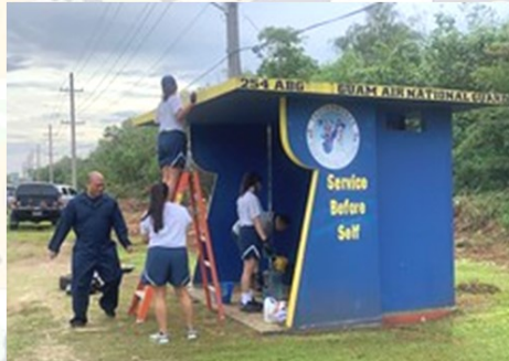
DMA and Guam National Guard helped spruce and paint a Bus Shelter .

On May 2018, the Guam National Guard held a fallen Heroes Memorial Ceremony for those who gave their lives serving their country and island.