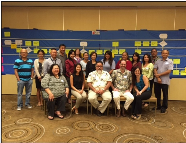
Process Mapping Workshop with ASTHO

The DPHSS Strategic Plan for 2015-2017 will help guide DPHSS keep up with current health challenges and modernize its public health system. With the long-term goal and vision in mind, the department aims to pursue future accreditation following elements of the strategic plan.