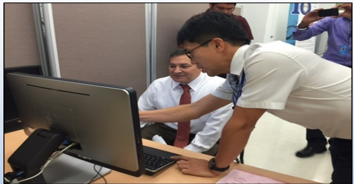
Pacific Open Learning Health Net (POLHN) Official Opening