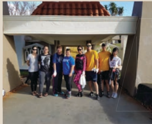
ISLAND WIDE BEAUTIFICATION DAY