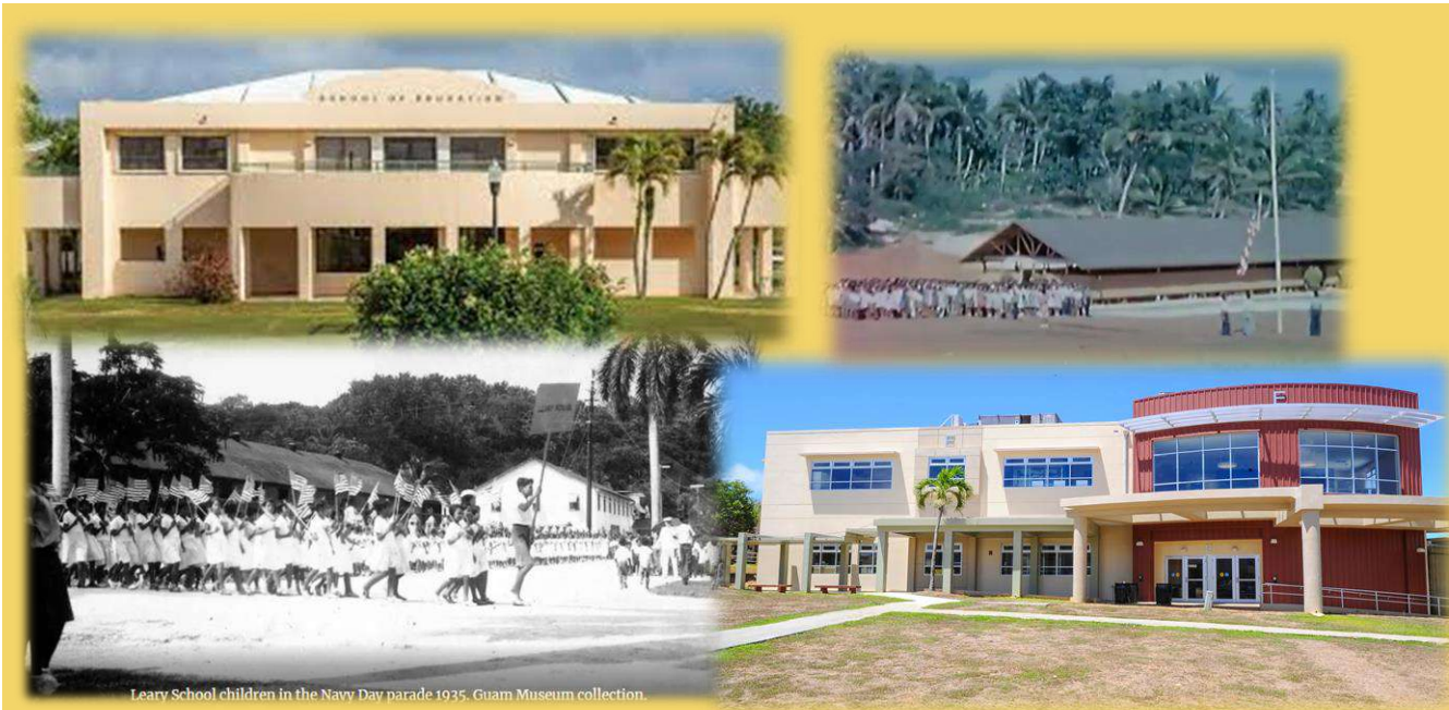
Leary School children in the Navy Day parade 1935.