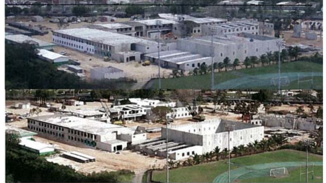
Feb 12, 2011 Precast Erection Phases 2, 3 & 4; Gym Walls erected, Precast Production Ongoing, U/G Utilities Ongoing

John F. Kennedy High School (JFK). In August 2010, GEDA and GovGuam issued a $66.7MM Certificate of Participation Series 2010 (JFK High School) for the demolition and construction of a new high school at the Tumon site.