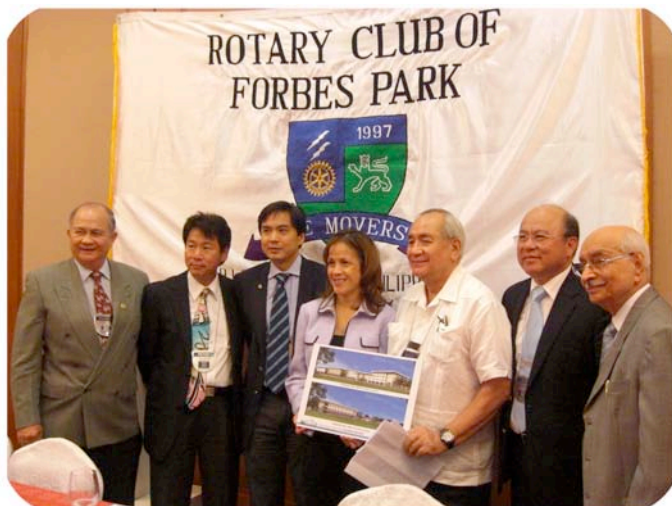
Manila (April 2010) Guam delegation meets with key members of the Filipino business community to discuss investments and Guam's expected economic potential and growth.

Regional interest in Guam continues to grow.