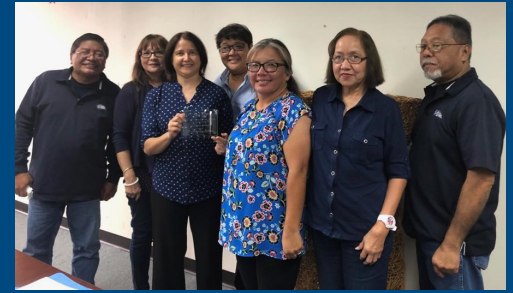
GHC received a Bronze Award in Citizen Centric Reporting, FY 2017, from the Association of Government Accountants Guam Chapter