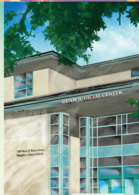
120 West O'Brien Drive Hagatna, Guam 96910