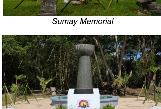
Kalaguac Memorial Barrigada