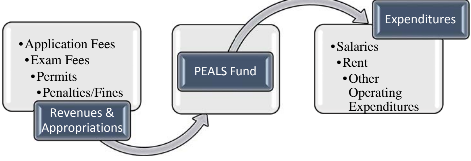
Chart 1: PEALS Board Revenue and Expenditures Flow

The PEALS Fund is the Board's primary source of revenue and expenditures, as shown in Chart 1. The DOA processes the PEALS Board's salaries, rent, and other operational expenditures. This includes expenditures for maintaining membership in the National Council of Examiners for Engineering and Surveying (NCEES) and the National Council of Architectural Registration Boards (NCARB), and the costs for Board delegates to attend meetings of these organizations. The Board also receives a legislative appropriation, which may be expended for any purpose the Board approves as reasonable and necessary for performing its duties. For Fiscal Year (FY) 2016, the appropriation was $327,061.