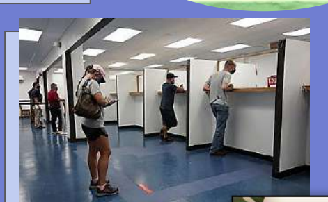
DMV Motor Vehicle Registration moves into DPW.

School Bus stops repaired by DPW Building Maintenance