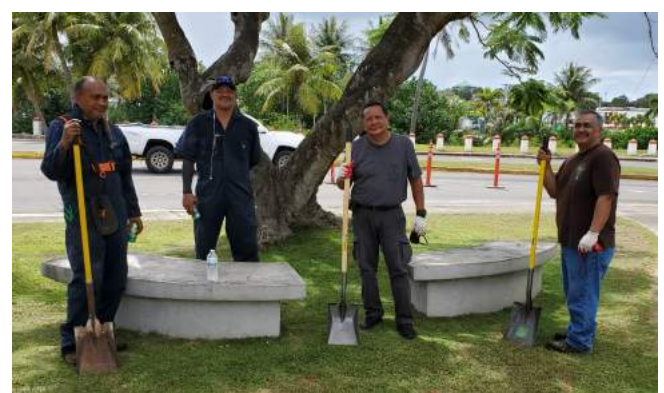
GEO & Guam Housing Corp staff at the Island-Wide Beautification Task Force Clean-Up, 6/26/20