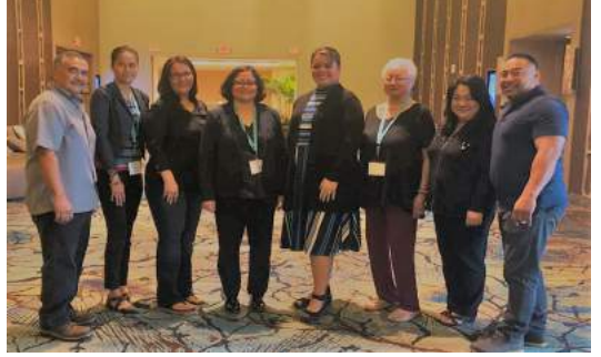
5th Assembly of Planners Symposium, GEO staff, Director and Senator Sabina Perez (center), 2/20/2020