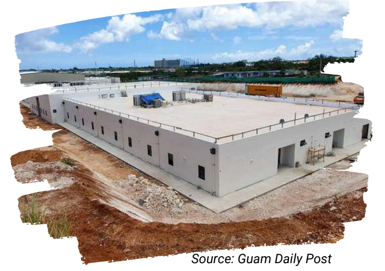
Sinajana Central Community Arts Hall