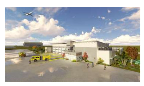
Aircraft Rescue and Firefighting Facility

GIAA will be soliciting for Design services for extension of Fuel System to service the Integrated Air Cargo Facility.