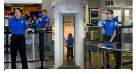
TSA Security Checkpoint Expansion

We're building up, literally! Phase II of the International Arrivals Corridor project is well underway. A whole new level is being constructed on top of the existing concourse area. Upon completion, the new floor space will effectively separate all arriving passengers from departing passengers, thereby meeting the TSA mandate to separate passengers in what is now a shared concourse.