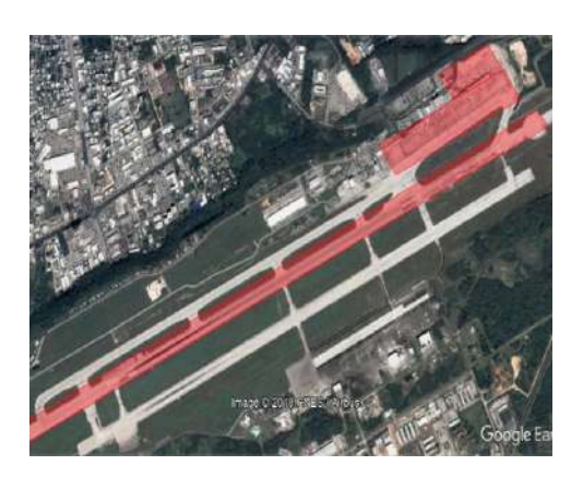
Runway 6L Rehabilitation And Airport Aprons & Taxiway Rehabilitation

A new Aircraft Rescue and Fire Fighting (ARFF) facility is being constructed to replace the current ARFF barn, constructed in the 1970s and transferred to the Airport Authority as part of the Naval Air Station Base Realignment and Closure Act in 1996.