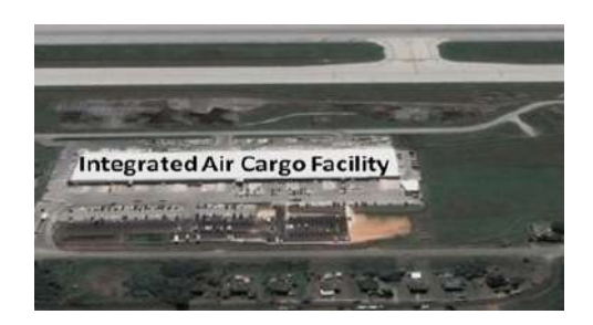
Cargo Apron- Extend Fuel System Design

Outbound passenger inspection lanes will increase from 5 to 7 lanes, facilitating the inspection process for departure.