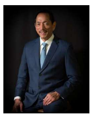
A MESSAGE FROM THE PUBLIC AUDITOR

In my fifth annual report as Guam's elected Public Auditor and the completion of the midpoint of my four-year term, 2022 was marked with significant improvements and upgrades to the Office of Public Accountability (OPA), specifically in the areas of our office's independence through its future budgets, updates in salaries for OPA staff through the full implementation of a pay study done in 2014, and upgrades in technological tools our office utilizes for its working papers.